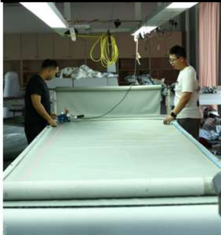
2. Sourcing fabric