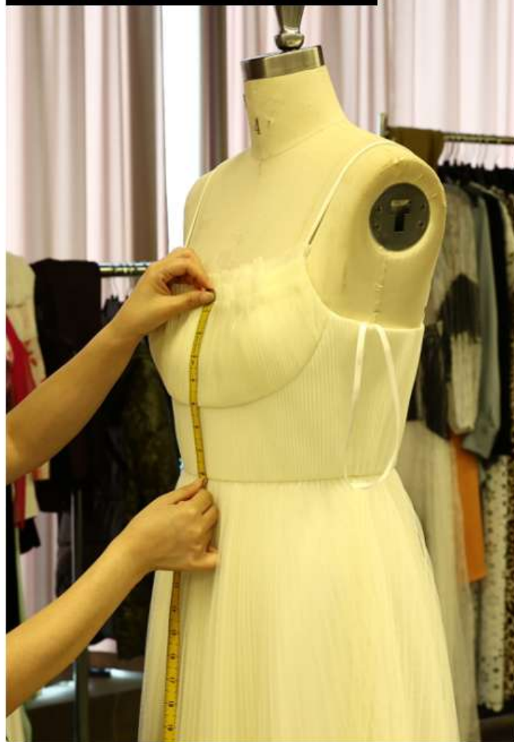
3. Sample confirmed