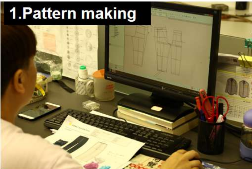
1. Pattern making